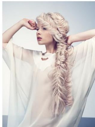
Full Fishtail using Great Lengths Hair Extensions.